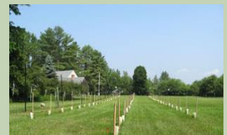
Chestnut in Vermont