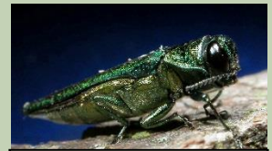
EAB Biocontrol in NH